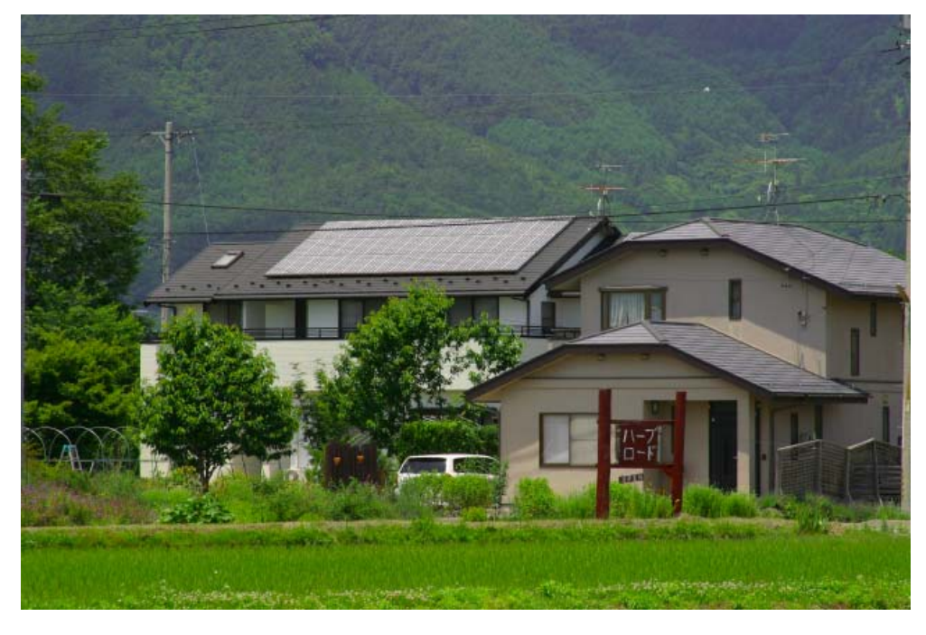
Photo voltaic grid feedback electric power array on rural house in Nagano prefecture

I got the impression that incentives for grid feedback solar power were not particularly good. A series of possible explanations for the high incidence occurred to me; Japanese personal affluence; love of fashionable high technology; and/or environmental commitment to alternatives to the nuclear industry. The adverts on the Shinkansen<sup>19</sup> boasting that Sanyo was the world's largest photovoltaic producer reminded me that the profits from the solar revolution flowed back to Japanese industry. Maybe all of these factors play a part but it was only researching for this article that I discovered two important facts that underscored the importance of market forces. Electricity costs in Japan are the highest in the OECD, and three times higher than Australia. In addition to this incentive for saving energy, the Japanese government in the late 1990's provided higher rebates on the installation of solar power than any other country including Germany.